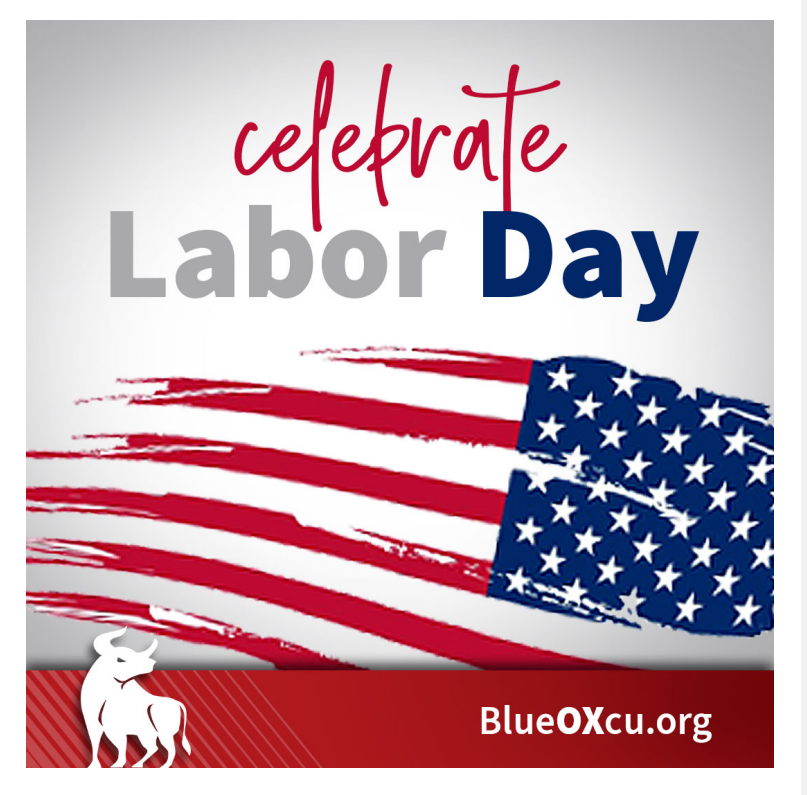
All BlueOx Credit Union branches will be closed from Saturday, August 31 - Monday, September 2, in observance of Labor Day. Enjoy convenient access to your accounts 24/7 with our <u>Digital Banking</u> services for your banking needs during this time.