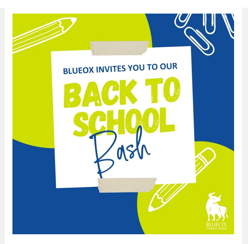
BlueOx is so excited to invite you to our Back-to-School Bash events! Join us this Saturday, August 3, at our Battle Creek and Albion Branches from 12 p.m. to 1:30 p.m. (or until supplies last). You can expect a fun-filled day of games, giveaways, and donated school supplies for all the kids returning to class in the Fall!