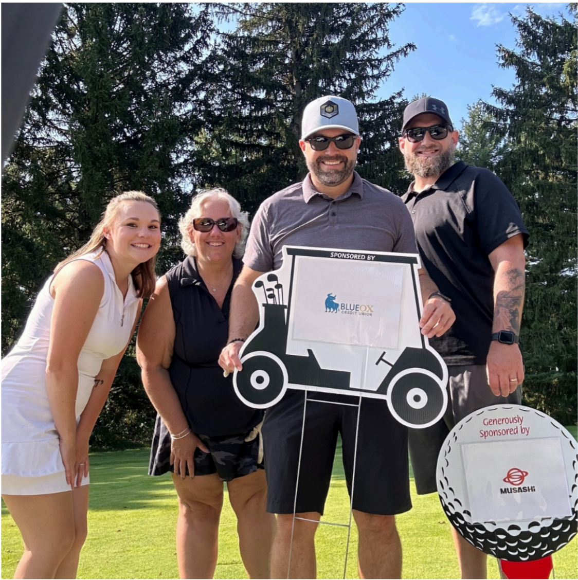
The BlueOx team had a fantastic weekend golfing at Binder Park Golf Course for the Harper Creek Educational Foundation Boosters Charity Golf Outing! The weather was just perfect, and the course looked stunning! Thank you to everyone who helped make this event so fun and enjoyable for all the golfers!