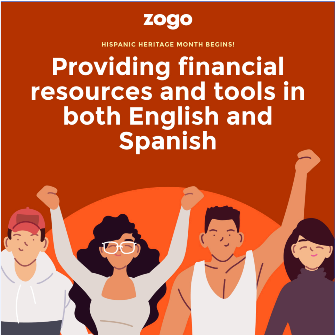
Starting September 15, we celebrate Hispanic Heritage Month, honoring the contributions of Hispanic and Latino Americans. Our financial education partner, Zogo , supports financial literacy within the Hispanic community by providing resources and tools in both English and Spanish. Join us in celebrating and empowering our Hispanic community!