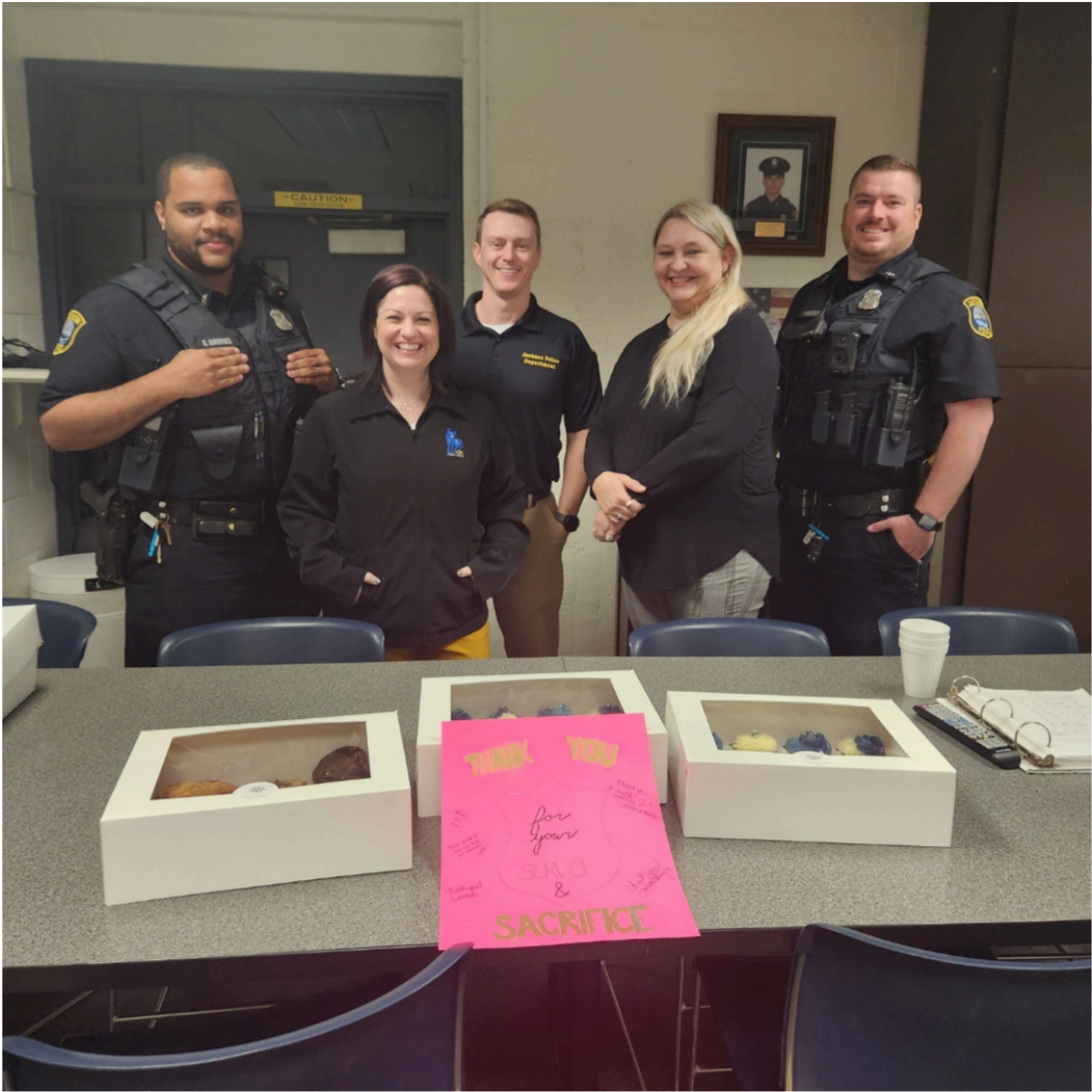
In celebration of Police Appreciation Week, our Jackson branch delivered cupcakes and cookies from The Five Forks to the City of Jackson Police Department! Thank you to all the officers who serve and protect our communities every day.