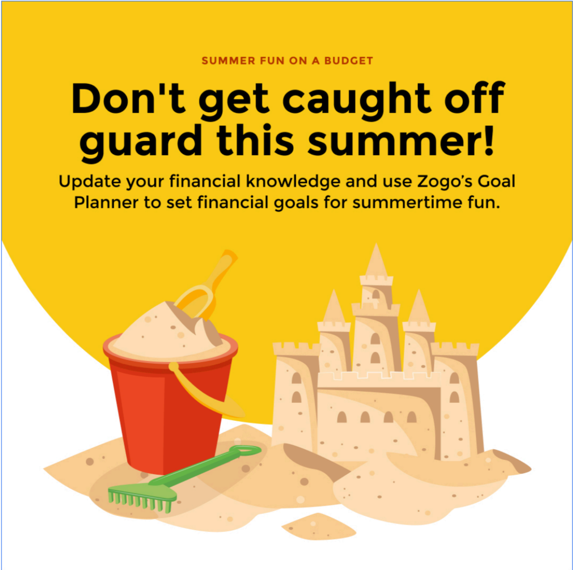
As the school year ends, don't let the costs of summer camps and activities catch you off guard. Update your financial knowledge and use Zogo's Goal Planner tool to set financial goals and make this summer unforgettable and financially stress-free!