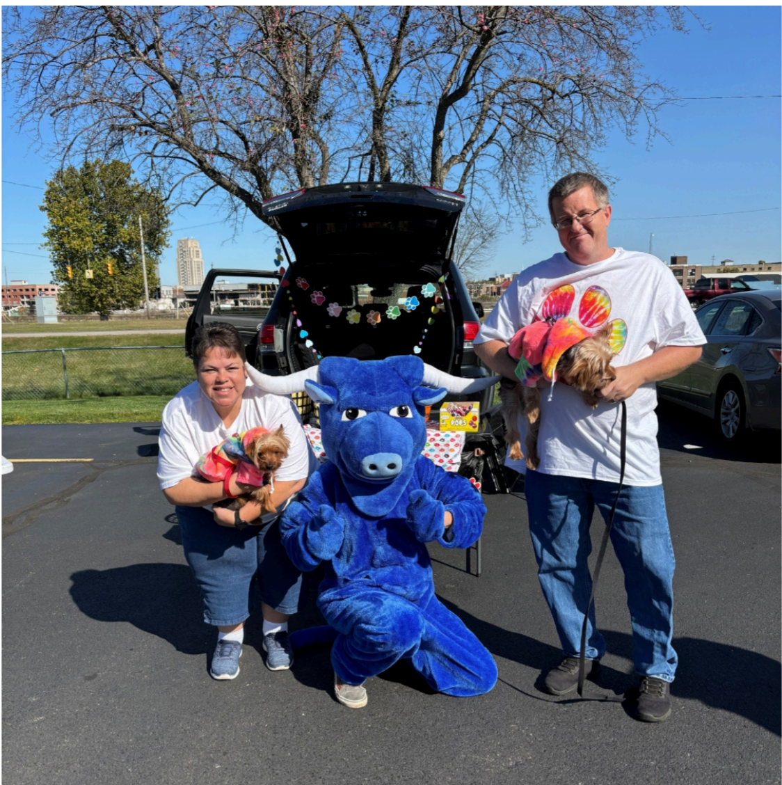
The BlueOx crew had a Boo-Tastic time at our annual Trunk-Or-Treat event! Thank you to everyone who joined us for the fun and festivities!