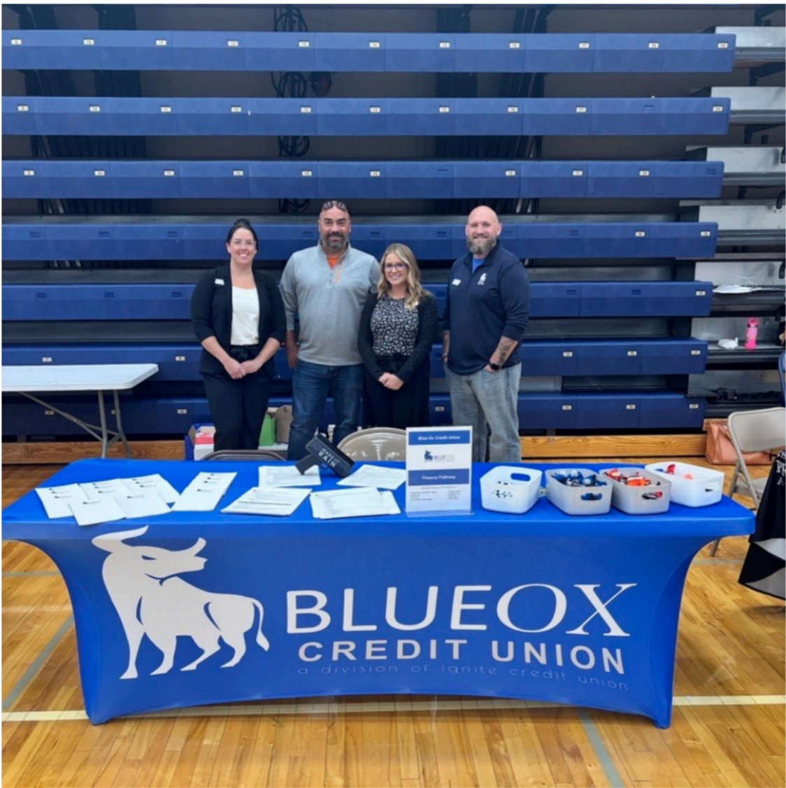
The BlueOx team had a great time at the Battle Creek Central Career Fair! Thank you to everyone who stopped by our booth. It was fantastic chatting with so many bright, driven students and hearing all about your career aspirations! Wishing you all the best on your exciting journeys ahead.